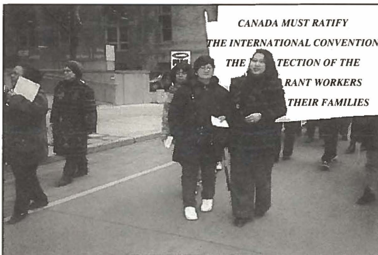
INTERCEDE members at the International Women's Day march held in Toronto which also launched the World March of Women against poverty and violence which will culminate in October in a march to the United Nations in New York.

1. To create and implement legislation to protect and promote the human rights, including social, political