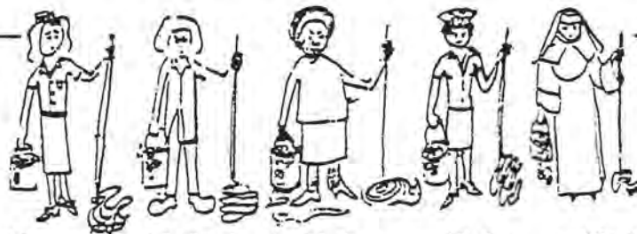
military political building medicine religion activism maintenance

The announcement for higher training allowances and job openings for women, as well as increased funding under the National Training Act, by Lloyd Axworthy does appear to be aimed at helping women break out of job ghettos.