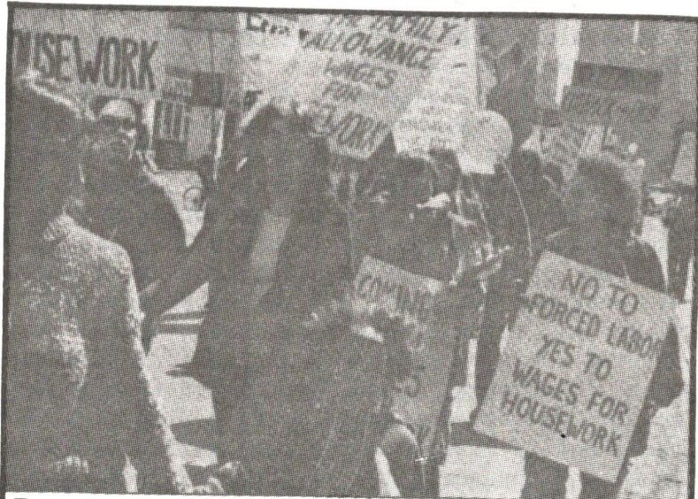
Toronto, 1976 -- Women, including members of Wages Due Lesbians, demonstrate against government cutbacks.

The essential commonality between our lives as lesbians and the lives of all other women has been hidden and with it, the possibility of making a unified attack against every situation of powerlessness that our collective poverty puts us in. The Wages for Housework Campaign goes past the fragmentation, to the reality of all women's persistent, daily struggles against unwaged servitude.