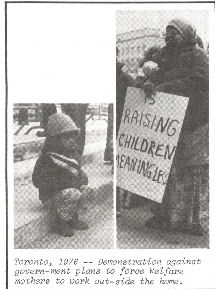
Toronto, 1976 -- Demonstration against government plans to force Welfare mothers to work outside the home.

We are all becoming more and more vulnerable to that intimidation. The current economic crisis -- inflation, cutbacks, etc. -- is having its greatest effect on women. We had the least to begin with. This crisis, by imposing more poverty on women, threatens to impose on all of us the status of "unfit mother."