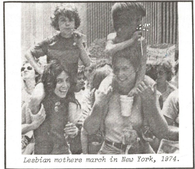
Lesbian mothers march in New York, 1974.

The same weakness and isolation from other women that have mangled our lives as individuals have also limited the gains that the lesbian movement could make. In our attempts to get together with other lesbians our weakness has meant we have sometimes had to organize within the "gay movement". The men's organizations, especially in smaller towns, are often the only places we can find other lesbian women. These organizations, because men have more money, can provide us with meeting space, telephones, dances, printing machines, etc., but the price we pay is the subordination of our interests to those of the men, whose power over us does not disappear when they are sleeping together. Through the "gay movement" some of us have been able to speak publicly as lesbians, to begin to reach other women.