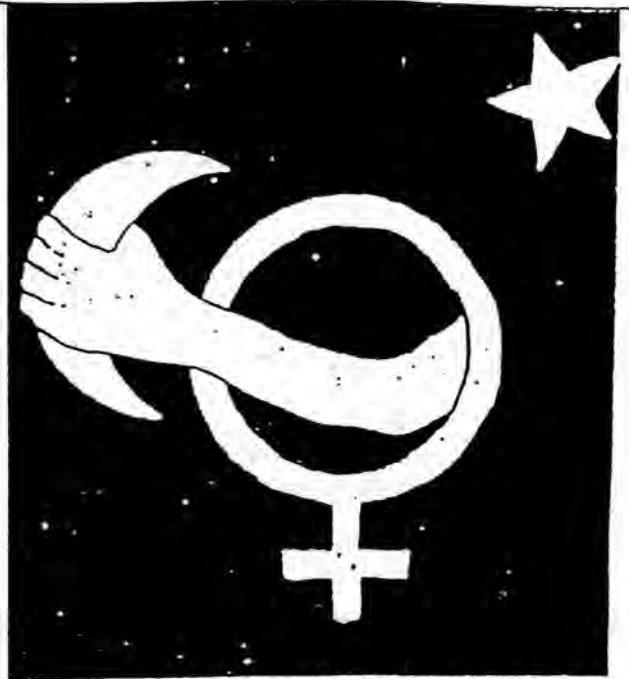
From Irish Feminist Calendar

We gather this September 13/91 to speak out against violence against women and support each other in this struggle to reclaim and empower ourselves as women, alone at night. We gather to honour the women who have gone before us, who fell