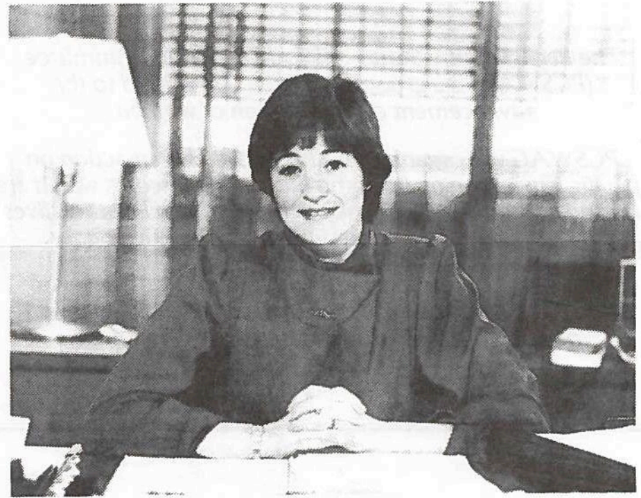
Maude Victoria Barlow Consultant, Host, Public Affairs Television Programme

Canadian women became "Persons" on October 18th, 1929.