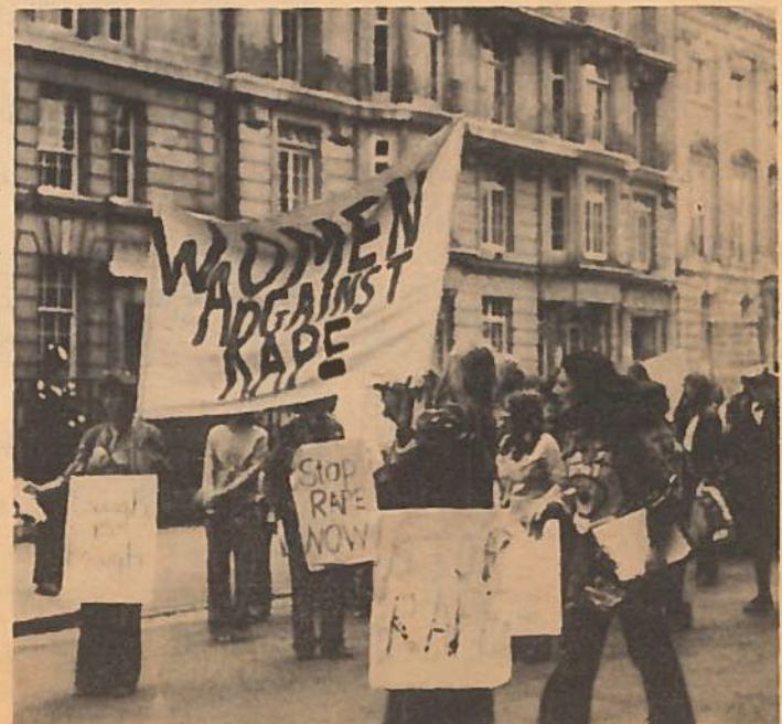
Hundreds of women join march led by Women Against Rape, London, England, July 16, 1977.

The powerful two-hour trial found Government and industry guilty of "conspiracy to rape and perpetuate violence against women in all its forms". Canadian women salute our sisters in Britain with a National Day of Protest Against Rape on Nov. 5!