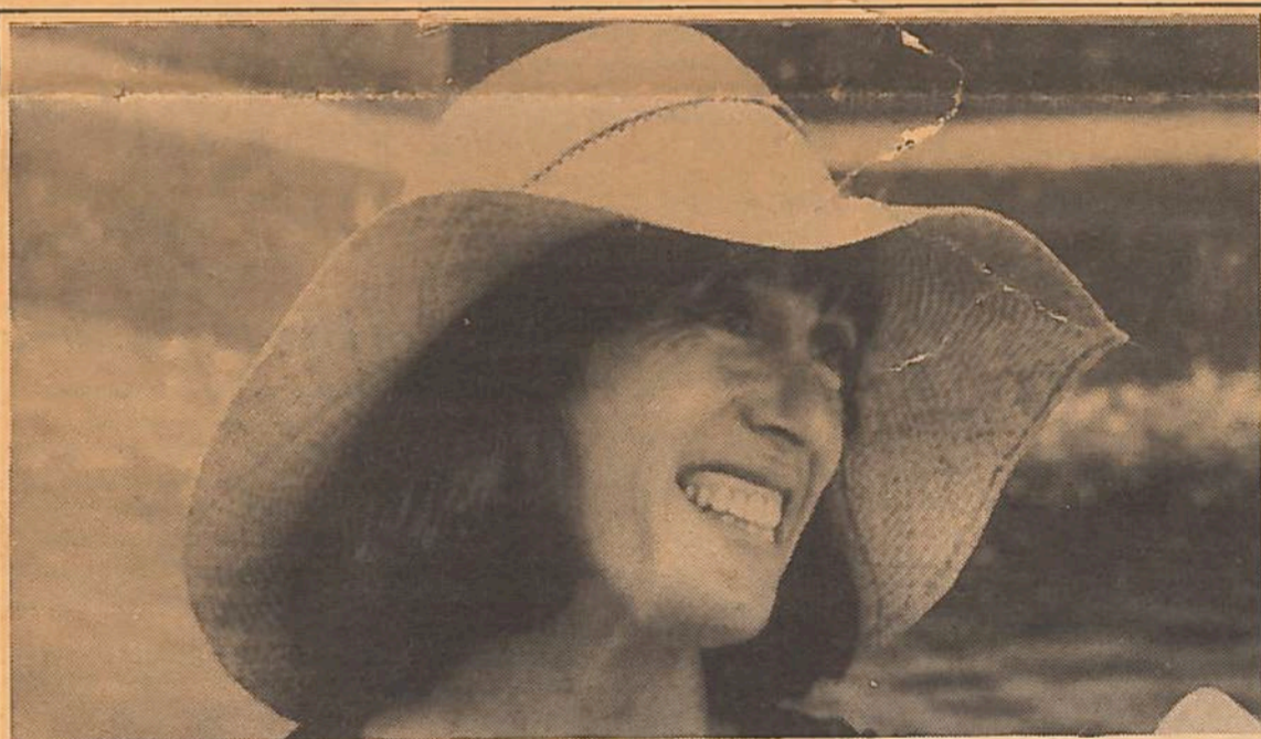
"Every little girl learns by the time she's five how to put the hustle on her Daddy for a new toy."

The Wages for Housework Campaign fully supports these demands and announces the upcoming visit of Margo St. James, of COYOTE (Call Off Your Old Tired Ethics) to Toronto! Housewives and hookers will be making a common cause Nov. 25-30 in a series of public events. Watch your local newspapers for more information.