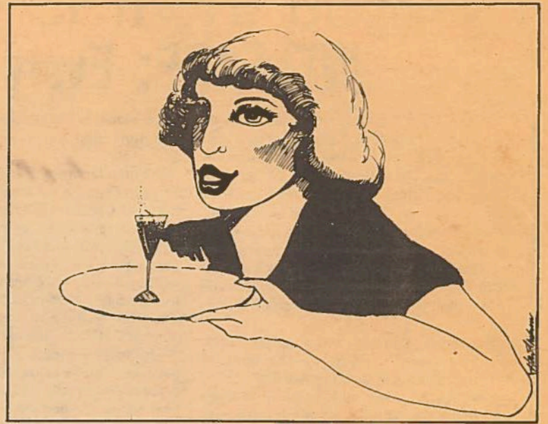
(Branching Out July-August 1977)

For more information contact: Black Women for Wages for Housework c/o Brown 100 Boerum Place Brooklyn, New York 11201 Tel. (212) 834-0992