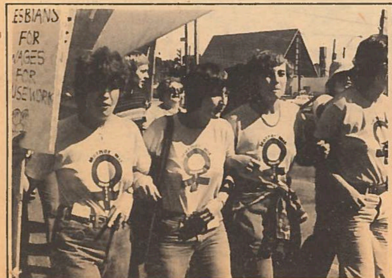
Lesbians lead gay rights march in Saskatoon, July 1, 1977.