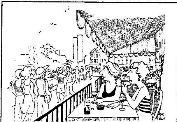
"Actually, there are only twenty lesbisns in Edmonton. It's all done with mirrors."

Rollerskating: Get Valentine's Day rolling. Start going around with your favourite sweetie. February 14 from 8 until 9 p.m. we have Wheelies Roller Skating Rink in Sherwood Park. Come skate for just $3.50.